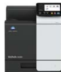
bizhub i-Series C4000i